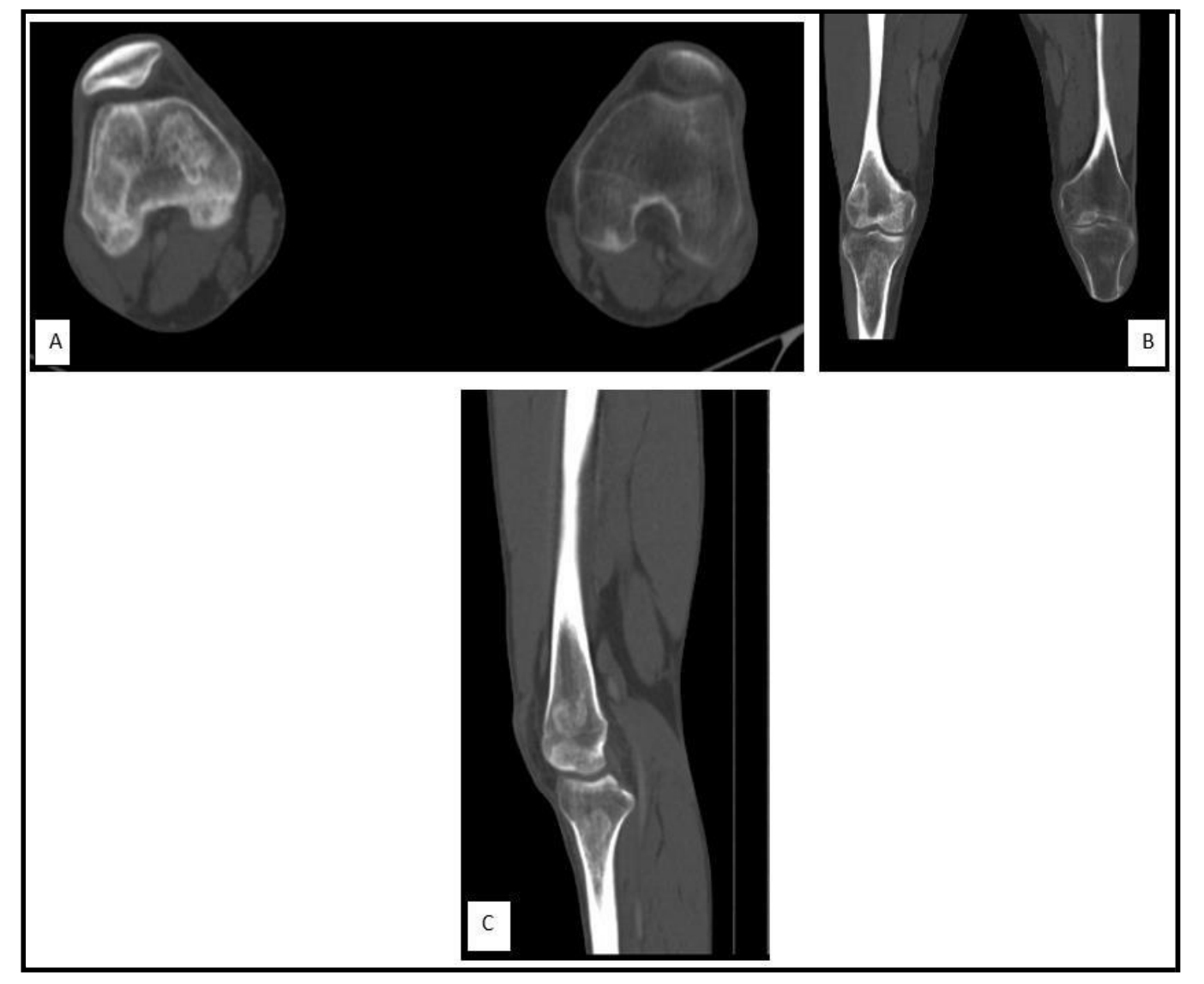
Figure 1: Axial (A), coronal (B), and sagittal (C) CT image displayed in bone windows shows a centrally located heterogeneous and largely sclerotic process that contains well-defined serpiginous margins; note the absence of cortical and periosteal involvement.